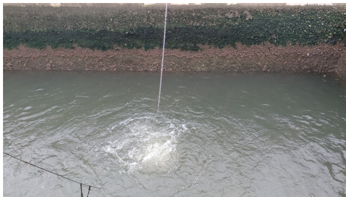
Pictured (above): SET installed a mixer in one of Lawrenceburg's chlorine contact basins; (below): The basin two weeks later

After seeing how well the AP500 performed in the wet well, Steve Summers, had problem that bred another good idea. One of the blowers in a chlorine contact basin was broken. Replacing the blower would cost $4,000 and the blowers run on four phase power. Not only is an AP500 is less expensive but will cost less to operate. Steve approached Lisa about the idea and then called me. They wanted to try in the basin.