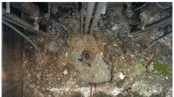
Pictured: Debris crust that had formed at the top of the wet well.