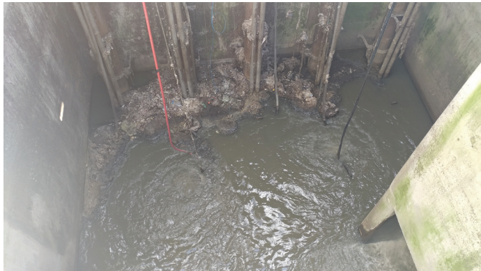
Pictured: One month after installing the lift station mixer, the majority of the debris crust had broken up.

One week went by, and it seemed that the hole in the crust had gotten a bit bigger and more liquid was visible. Another week went by and the hole had grown even more. After three weeks, there was significant breakup of the crust in wet well.