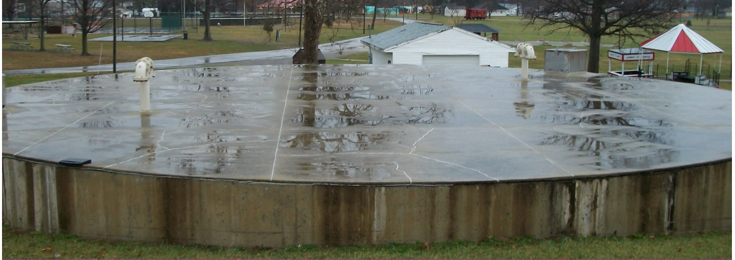
One of two identical partially buried concrete clearwell tanks

Topics: clearwell, certified tests, chlorine, trihalomethane reduction, stratification