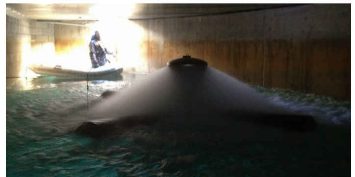
First-generation GridBee® SN Series Spray Aeration