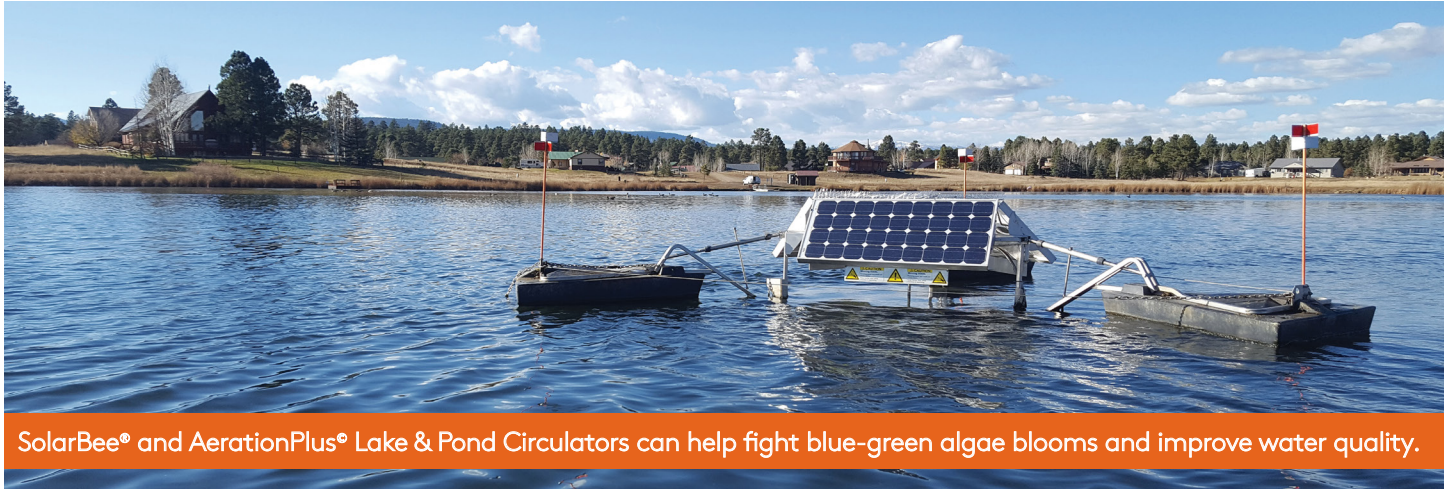
SolarBee® and AerationPlus® Lake & Pond Circulators can help fight blue-green algae blooms and improve water quality.

The “Jar & Stick Test” is an easy way to distinguish between good algae and cyanobacteria.