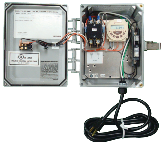
Figure 2: GridBee Timer Disconnect Box, Internal