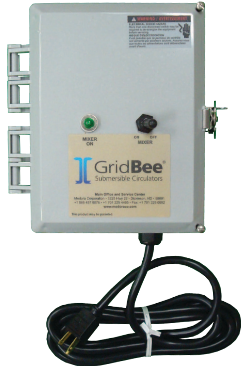
Figure 1: GridBee Timer Disconnect Box, External