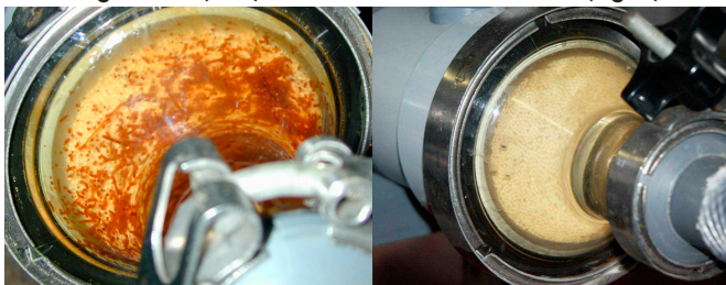
Figure 2: UF membrane backwash after pretreatment with in-line coagulation (left) versus MIEX® Pretreatment (right)

MIEX® Pretreatment has the potential to significantly extend GAC life by removing 40-90% of the raw water DOC, reducing DOC loading on the GAC. By removing the bulk of the DOC at the head of the plant, MIEX® Pretreatment can extend the life of GAC exponentially, typically paying for itself over a projected life cycle.